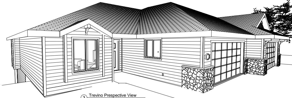
③ Trevino Perspective View